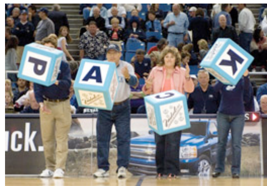
A recent promotion at the University of Nevada, a Hole In One production.