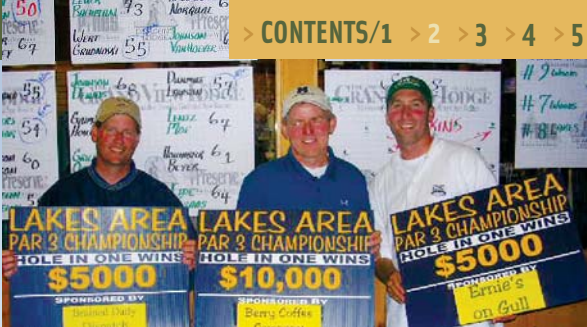
Three ace-making amigos.

"Along with the quicker pace of play, there is a